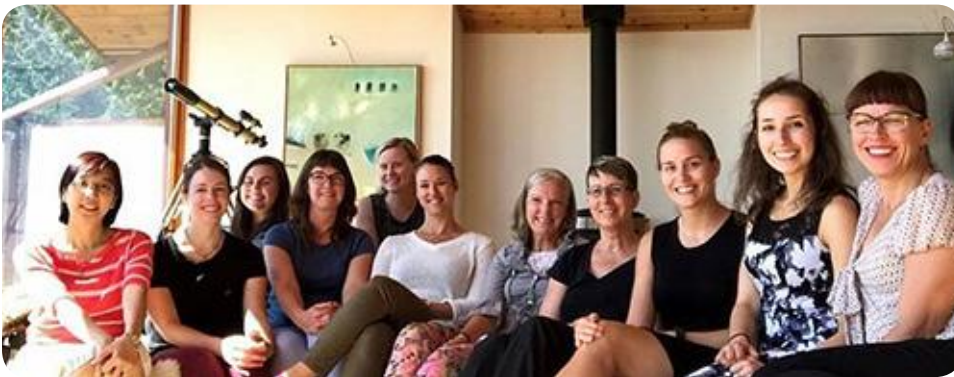
The BCRPA Team at a staff retreat.

As we do with our members, this year, we emphasized the importance of our staff connecting with their peers in other provinces and territories. The opportunity to strengthen our staff network, share ideas and innovations, and raise our profile and esteem nationally is incredibly valuable.