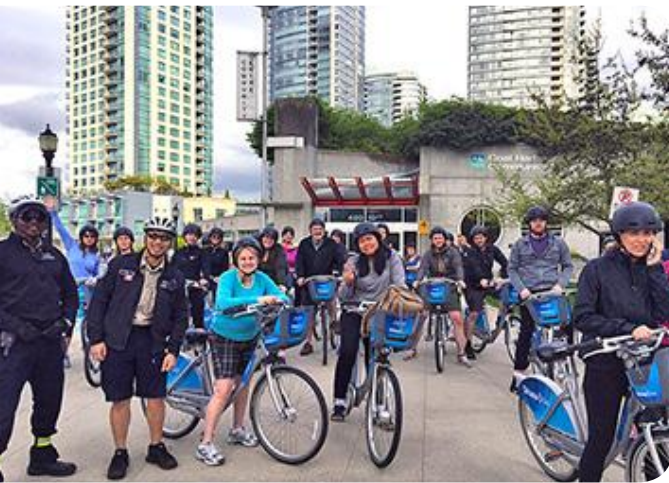
Members on the move at Symposium

We kicked 2019 off with our annual membership drive which saw more members than ever before join BCRPA! We were also thrilled to welcome back a number of Local Governments from across various corners of the province whose enrollments had lapsed in previous years. This is a testament to the renewed faith and growing recognition of the significant value BCRPA membership provides, and our deep commitment to serving our members.