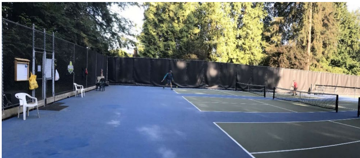
Figure 1: Pickleball courts surrounded by reflective noise barrier

Figure 1 shows an example of a sound reflective barrier material installed on the chain link fence at the Murdo Fraser pickleball courts in North Vancouver.